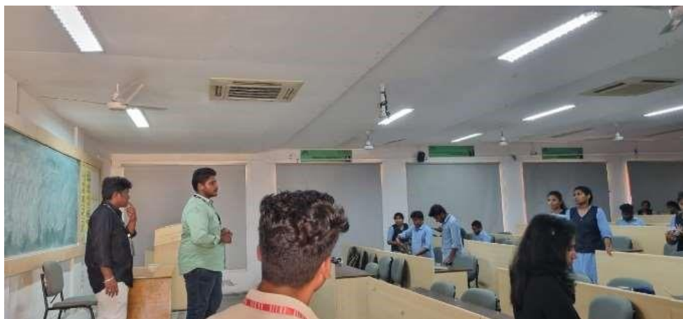
Promoting at vignan collage vadlamud

The involvement of a PR team in registration activities for events like YANTRIK is crucial. The PR team is responsible for creating awareness about the event and its importance among the target audience. They work closely with the registration team to ensure that maximum participation is achieved. The PR team plays a key role in reaching out to various departments in the university and outside colleges to promote the event and encourage registrations. They use various communication channels like social media, emails, posters, and banners to create a buzz about the event. Their efforts help in building a positive image of the event, which leads to a higher turnout and a successful event.