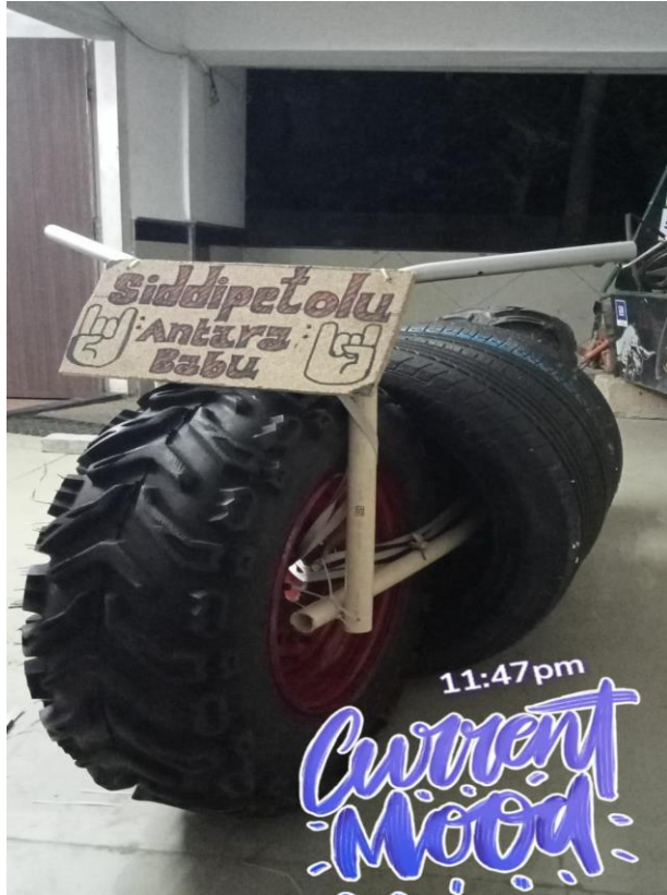
Making bike with