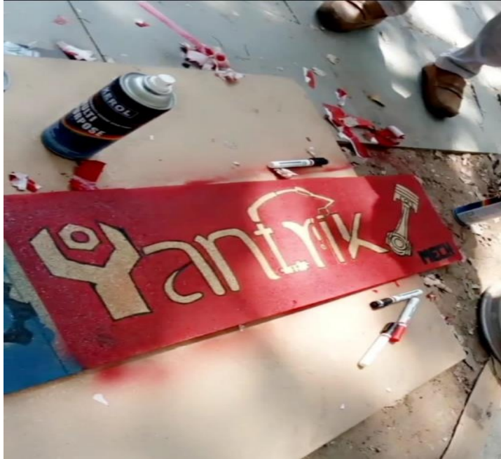
Making of YANTRIK board