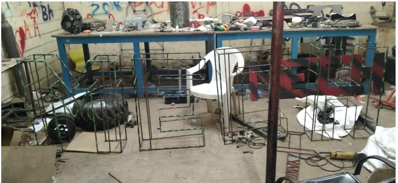
Making of "MECH" with metal